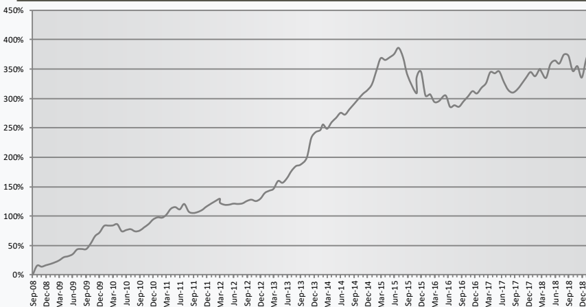
The rate of return chart shown is used only to illustrate the effect of the compound growth rate and is not intended to reflect future values of the Index or the Fund or returns on the investment in the fund.